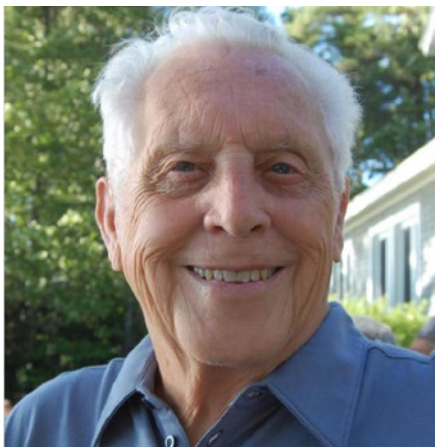
Richard "Dick" Clark